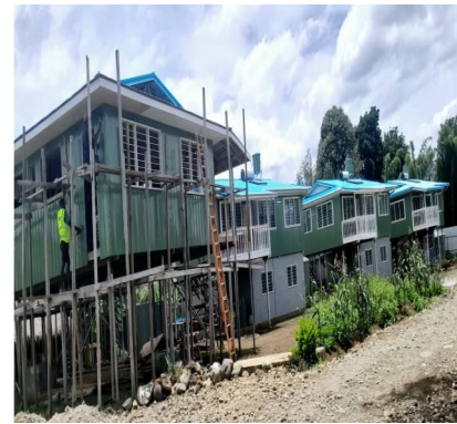
D) 8 X 3 Bedroom Duplex under construction by Moha Limited