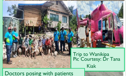
Doctors posing with patients after successful surgery.