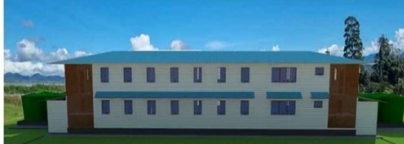
B) Proposed 28 Men Male Quarters

The Hela Provincial Health Authority (HPHA) staff will soon have additional accommodations at the Tari Provincial Hospital. HPHA has invested on major Capital Works Projects to provide accommodation for its staff within the Hospital. HPHA believes that its staff are critical to providing health services therefore their well-being and safety is priority. Providing accommodation to its staffs in a safer environment will not only boost the staff moral but will also improve their performance in their respective work areas.