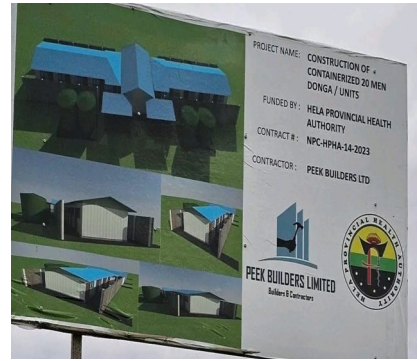
C) 20 Bedroom Staff Transit Accommodation