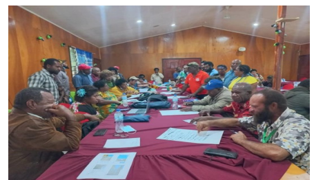
Participants during the workshop