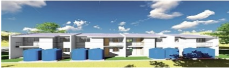
A) Proposed 8 x 2 Bedroom Duplex Units