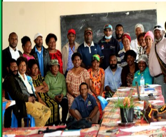
Male Advocacy Participants 2022