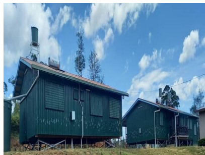
Front view of Waiting house and Maternity Wing

delivery process. The addition of a waiting house at Fugwa Health Center not only complements the existing maternity wing but also ensures that mothers from distant communities receive the care and support they need during the delivery process.