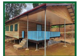
Newly Constructed Tade Health Post

An officer employed by the Hela PHA has been appointed to manage and operate the health post. The reopening of Tade Health Post represents more than just the availability of healthcare services; it symbolizes a collective effort to transform the community's narrative.